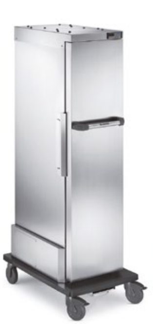
BLT 1220 EUK