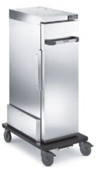
BLT 1020 EUK