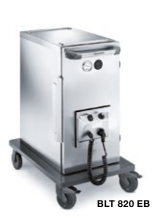
BLT EB – heatable