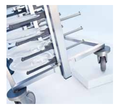
More safety under all conditions The plate holders with a soft-grip surface ensure maximum safety during transport, even when traversing thresholds and uneven floors.