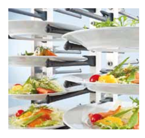
More space for creative ideas With its 80 mm plate spacing, SERVISTAR leaves you enough room for all your ideas while arranging food in an appetizing way.

And because that still doesn't suffice, BLANCO SERVISTAR features many well-thought-out details to make your daily work easier.