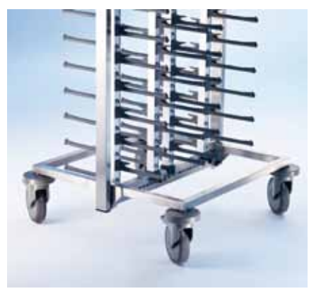
More stability in everyday life The bend and twist-resistant stainless steel frames which are each permanently welded give the SERVISTAR its rugged strength so that you can manoeuvre safely even when the trolley is completely loaded.