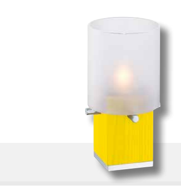
RAL 1023 traffic yellow