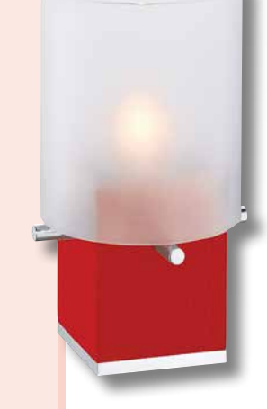
table lamp large PURE EXCLUSIV COLOUR

featured in this image are 2 + 10 + 11 + 14 + 18 + 19