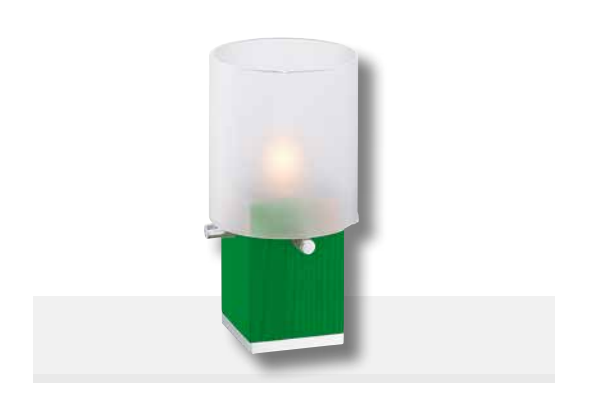
RAL 6018 yellow green inspired ambience on page 11

The colour options are made-toorder. Full details regarding pricing and delivery times are available on request.