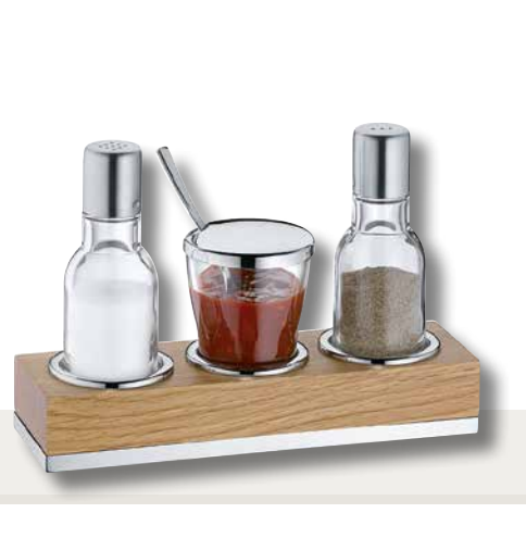
ASIA set PURE EXCLUSIV NATURE stainless 18/10, varnished wood, glass

featured in this image are 2 + 10 + 11 + 14 + 18 + 19