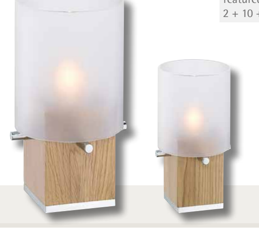
table lamp large PURE EXCLUSIV NATURE stainless 18/10, varnished wood, glass satin finished

featured in this image are 1 + 2x + 10 + 11