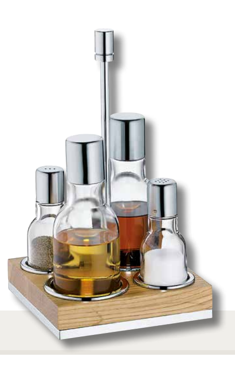
oil and vinegar set PURE EXCLUSIV NATURE stainless 18/10, varnished wood, glass

featured in this image are 2 + 10 + 11 + 14 + 18 + 19