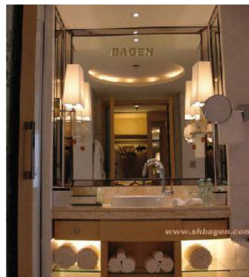
Series I :Rectangular