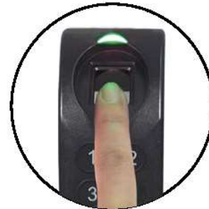
Fingerprint Scanner for Secure and Easy Access