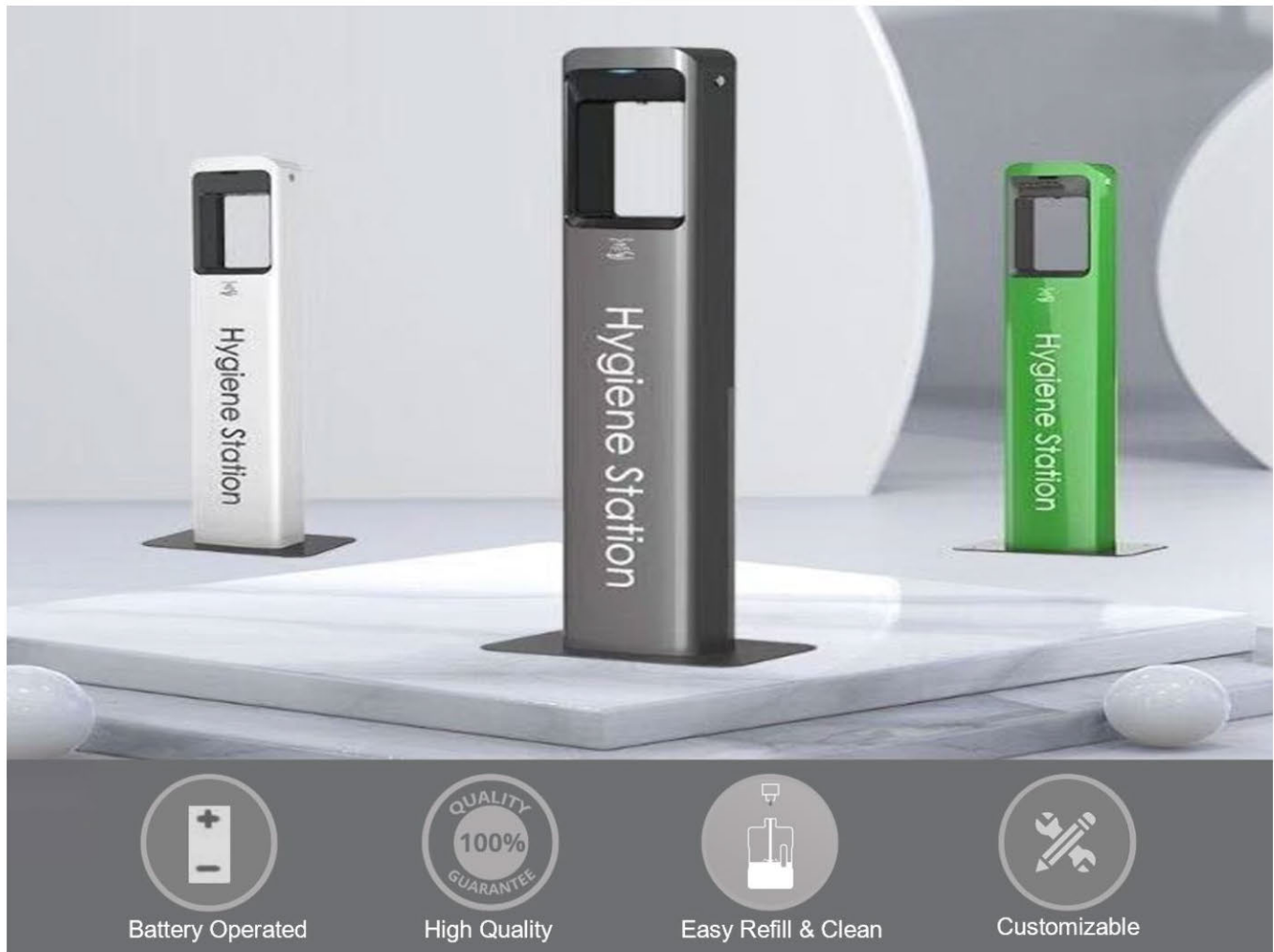
GermClean™ Model HSN-5010 Hygiene Station