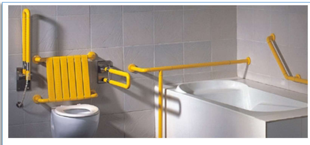
Handicap Grab Bar Series (Nylon & Stainless Steel)