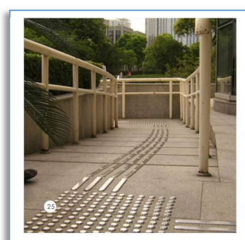
Tactile Indicator Series

For more information about this great product: