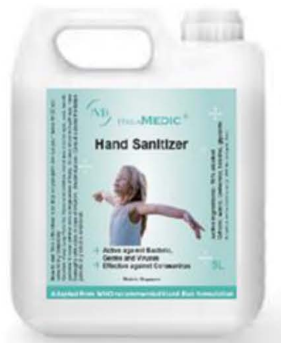
Hand Sanitizer 5L, 388050