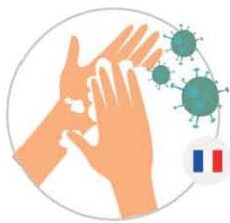
Hand Sanitizer 1L, 388010