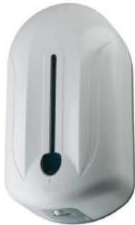
Saphir Automatic 844397