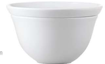
UPDATE SET bowl 0,50 l / lid 14 cm