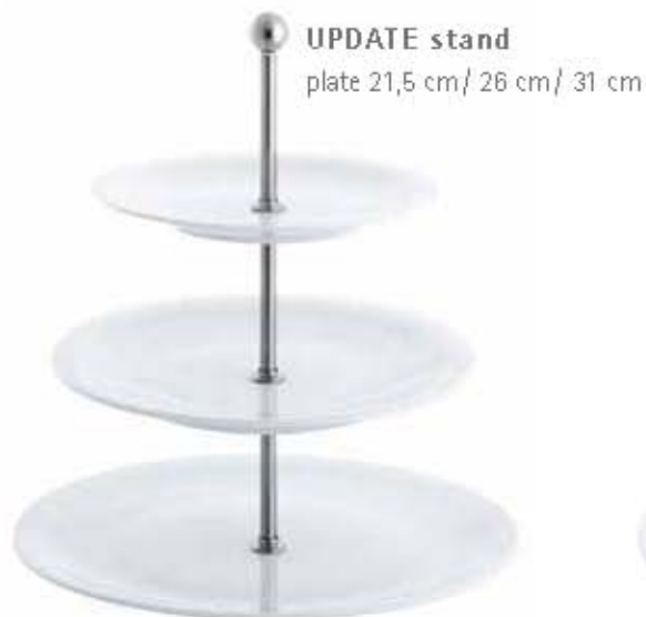
UPDATE stand plate 21,5 cm / 26 cm / 31 cm