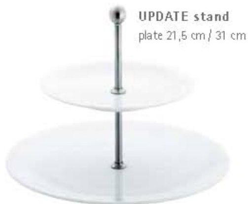
UPDATE stand plate 21,5 cm / 31 cm