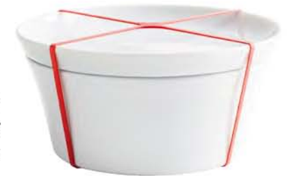
SNACKIT MEDIUM bowl 14 cm / lid 14 cm / rubber band red