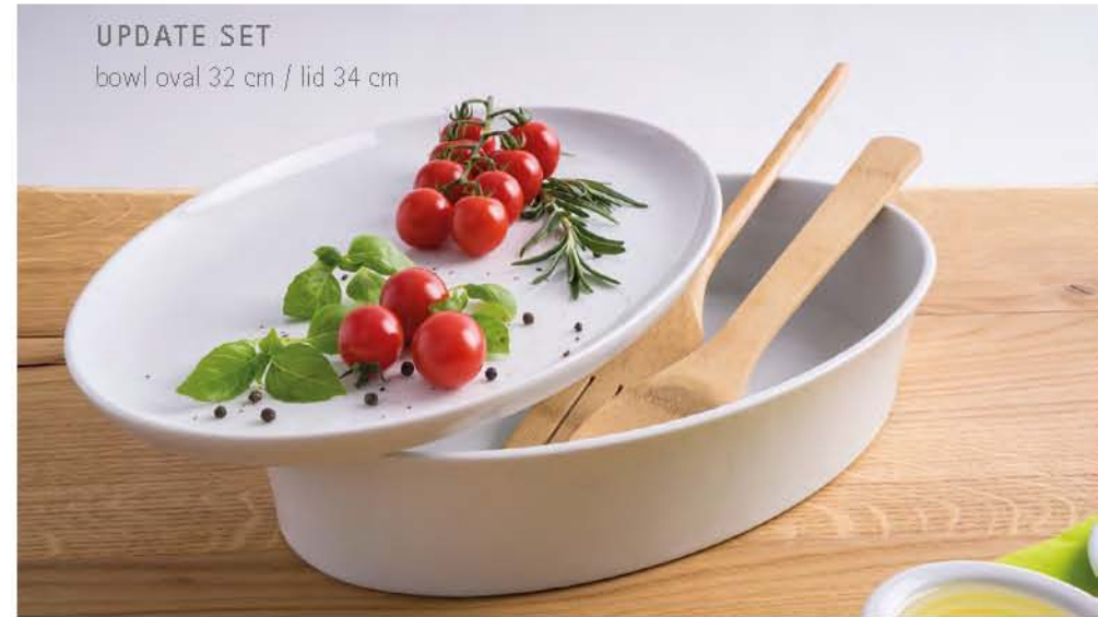
UPDATE SET bowl oval 32 cm / lid 34 cm