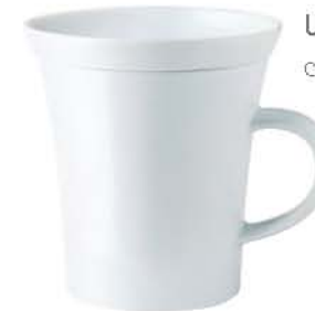
UPDATE SET cup 0,30 l / lid 10 cm