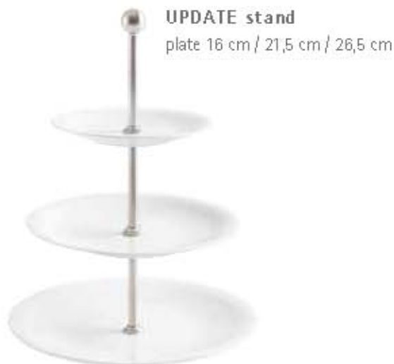
UPDATE stand plate 16 cm / 21,5 cm / 26,5 cm