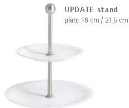
UPDATE stand plate 16 cm / 21,5 cm