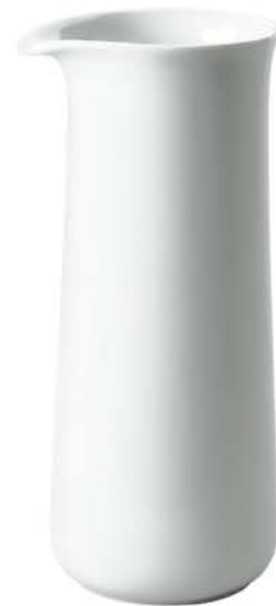
FIVE SENSES carafe 1,0 l