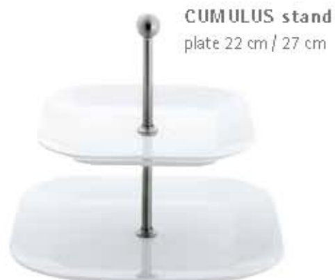
CUMULUS stand plate 22 cm / 27 cm