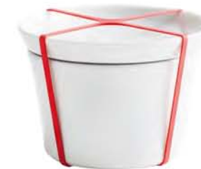
SNACKIT SMALL bowl 9 cm / lid 10 cm / rubber band red