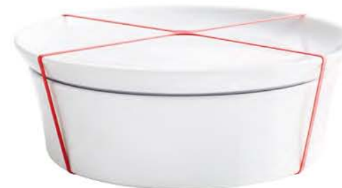
SNACKIT LARGE bowl 20 cm / lid 21 cm / rubber band red