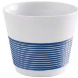
CUPIT MINI mug 0,23 l