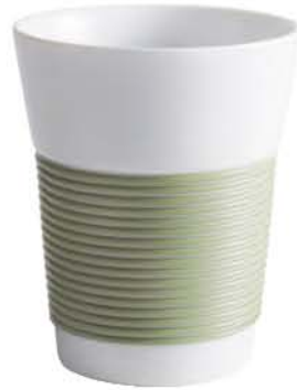
CUPIT MIDI mug 0,35 l