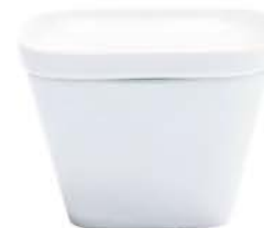
ABRA CADABRA SET bowl 6x6 cm / lid 10x10 cm