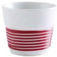
CUPIT ESPRESSO mug 0,09 l