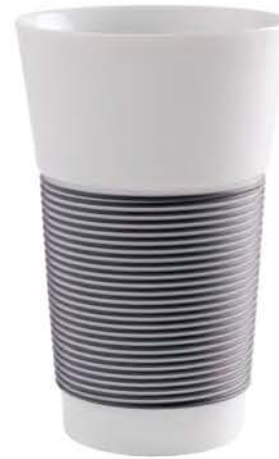
CUPIT MAXI mug 0,47 l